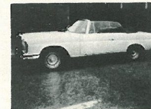
MERCEDES 280SE, convertible, 1969, one owner, 73,000 miles, full history, beautiful white with blue leather. £12,000