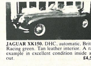
JAGUAR XK150. DHC, automatic, British Racing green. Tan leather interior. A rare example in excellent condition inside and out. £4,500