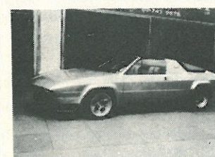
LAMBORGHINI SILHOUETTE, 13,000 miles, silver, matching interior, tinted electric windows, air conditioned, radio/stereo, etc. Breathtaking appearance. £17,950