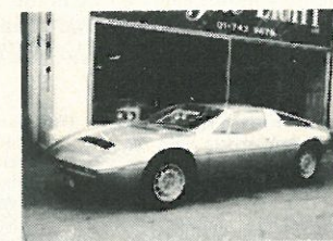
MASERATI MERAK. signal red/blue Velour interior, radio/stereo, air conditioning, etc. 1976. £7,500