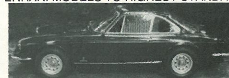
Ferrari 365 GTC. Red with black trim. Outstanding example. £17,750

SERVICE, REPAIR, RESTORATION AND RACE PREPARATION OF ALL FERRARI MODELS TO HIGHEST STANDARD