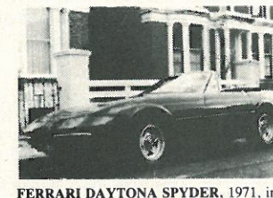
FERRARI DAYTONA SPYDER, 1971, impeccable appearance in black with black leather. Absolute Concours condition. POA