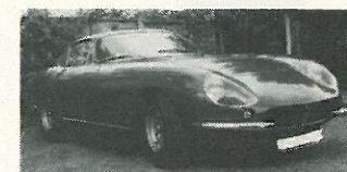
Ferrari 275 GTB 4 cam. Red with black trim. Well maintained. Right hand drive. £30,000