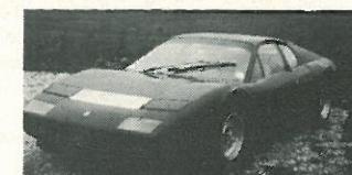
Ferrari 365 Boxer. Metallic midnight blue with cream leather. 17,000 kilometres. Very good allround condition. Left hand drive. £12,950

At present we are looking for a Ferrari 308 GTB, 308 GT4, Ferrari 400 and right hand drive Boxer