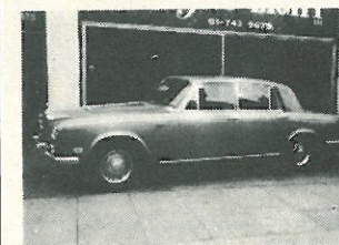
ROLLS-ROYCE SILVER SHADOW, 1974 flared arch, extremely attractive Caribe acqua/beige hide. £12,750