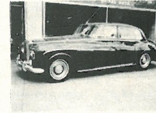
ROLLS-ROYCE SILVER CLOUD III, long wheel base, with division, 1964, dawn blue with beige hide, tinted glass, full history, chauffeur maintained. Stunning example. £12,950